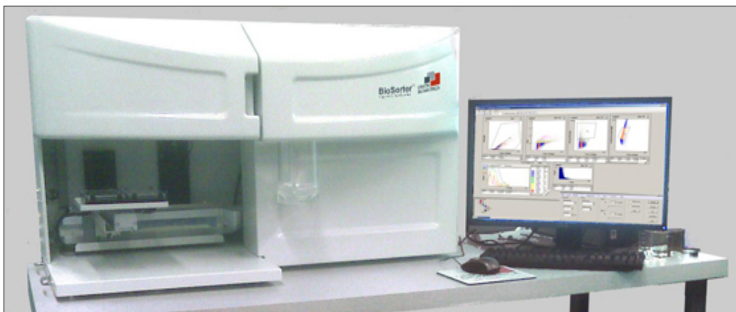
Figure 1. The BioSorter is a multi-range analyzer and sorter that allows high-throughput handling of objects from 10 \mu m to 1500 \mu m.